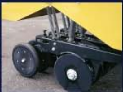
Rugged double disc opener with "T" handle adjustable presswheel