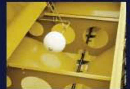
Extra large capacity seed box with seed agitator